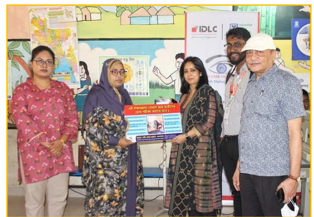
EPP was handed over to the Headmaster by ECP members

Following the briefing by the ECP team, the placard is hung in a prominent place in the school, where everyone can easily see the indicators.