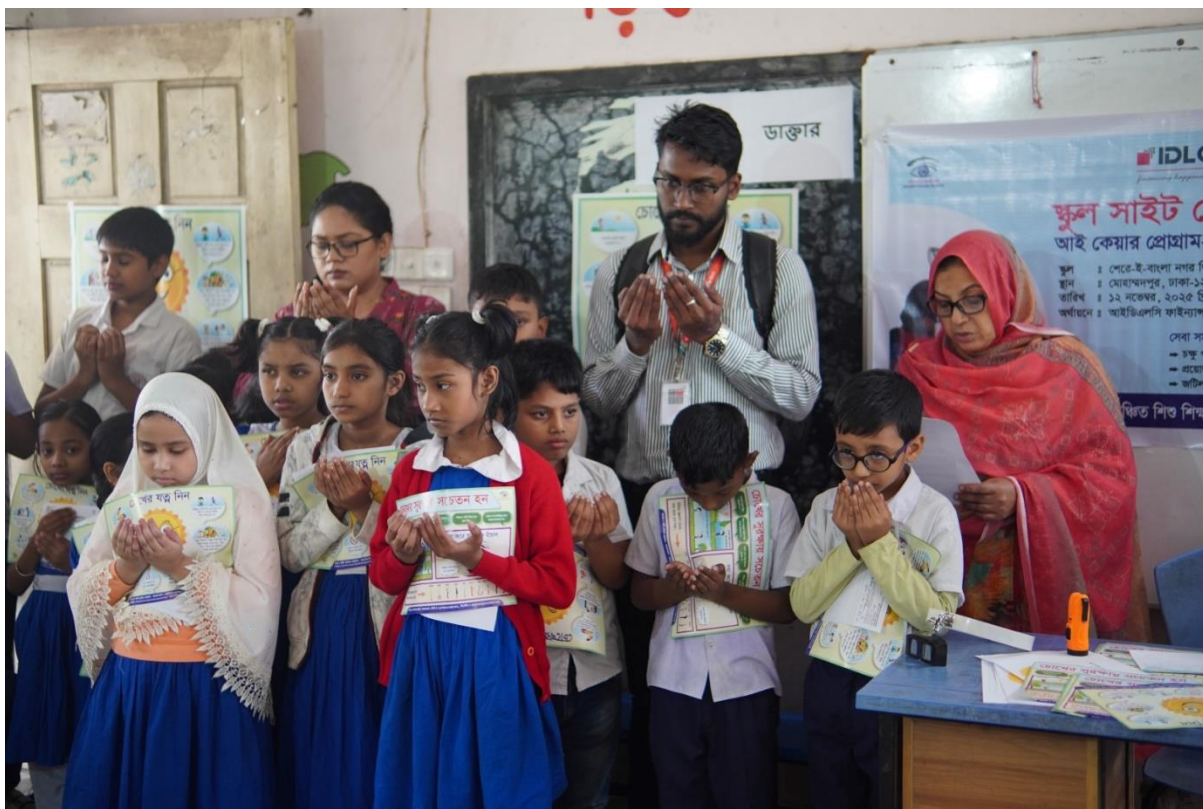
The program commenced with our donors' sincere prayers for its success and impact.