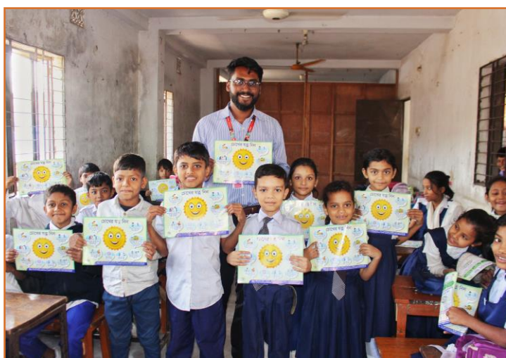
Students of School Sight Testing Program

This eye awareness program taught us so much! Many of us had no idea how vital it is to care for our eyes. The sessions were engaging, simple to follow, and showed us how to protect our vision and recognize early signs of eye issues. The team was patient, supportive, and answered all our questions with care. We now feel more confident about maintaining healthy eyesight. Thank you for sharing this valuable knowledge with us! "