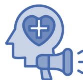
Awareness Sessions 11