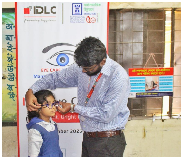
Students are delighted after receiving their customized spectacles