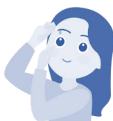
Eye Drops 34