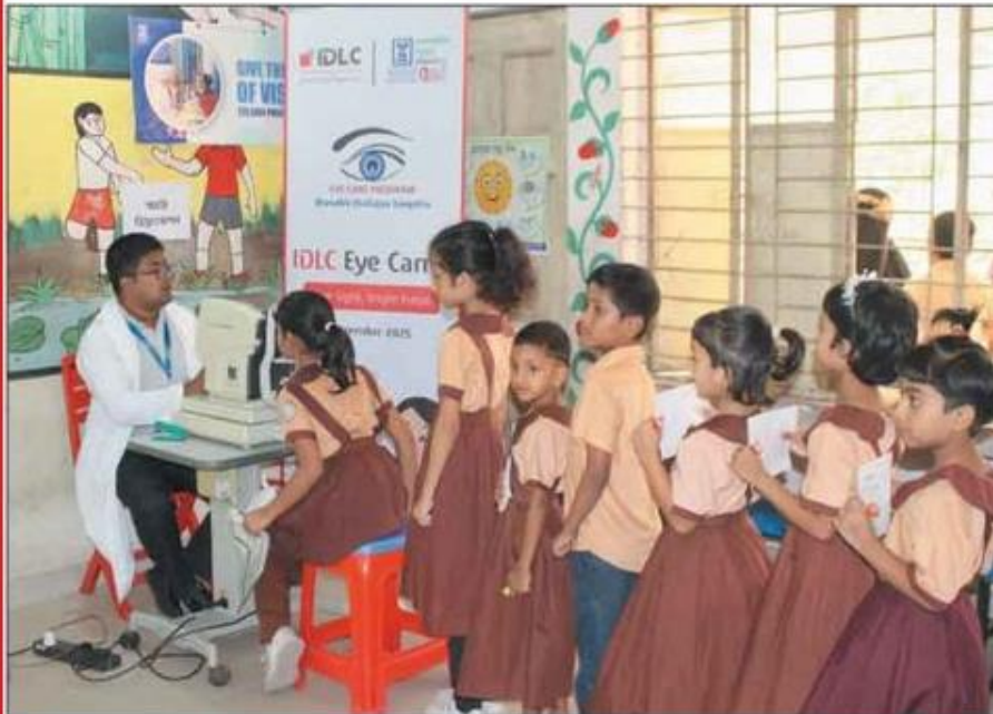
The camp at Gajmohan Tannery Government Primary School provided services to 290 students and staff, with 40 individuals receiving free eyeglasses.

The initiative was made possible with the generous support of IDLC along with the enthusiastic participation of the students.