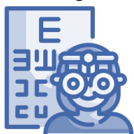
Eye Screening 594 Students, Teachers, Staff

This vital initiative was made possible through the generous sponsorship of IDLC Finance . Their support was instrumental in funding the necessary supplies and logistics for the screening camp. Additionally, ECP-MSS provided technical expertise, professional staff, and logistical management to ensure the smooth and effective execution of the entire program, demonstrating a powerful collaboration in support of community well-being.