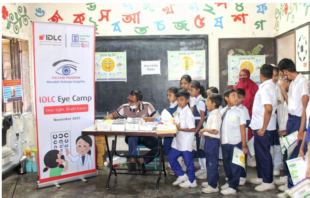
Student smiles with delight after receiving essential eye drops for treatment.