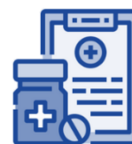
Referral Patients 5

The students attending both Sher-E-Bangla Nagar Shishu Sikkha Government Primary School and Gojomahal Tanery Government Primary School are primarily from lower-income urban communities. Their parents are typically engaged in informal labor or low-wage service jobs, leading to significant resource limitations at home and making the children particularly vulnerable. Consequently, these students are highly reliant on government schools and essential welfare programs, making support programs such as the free eye screening program crucial to their health and educational success.