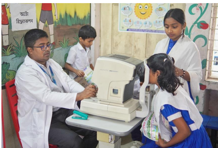
Students undergo eye exams using an auto refractometer to check their vision.