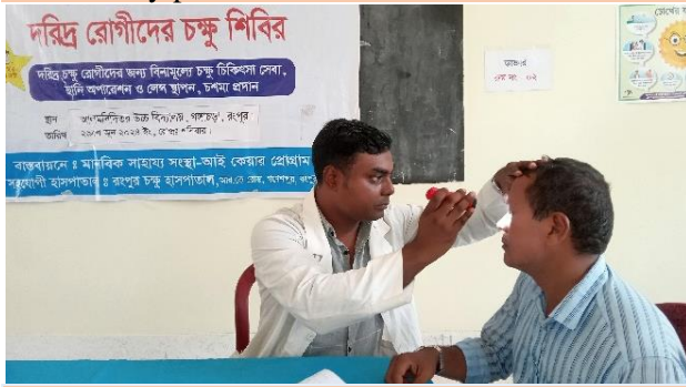
Doctors examining the patients at Alambiditor Eye Camp

A public eye camp was conducted in Alombiditor High School, Gongachora, Rangpur by ECP-MSS with the technical assistance of Rangpur Eye Hospital on 26 th June 2024. Cataract was identified among 101 patients, and 73 surgeries were successfully performed.