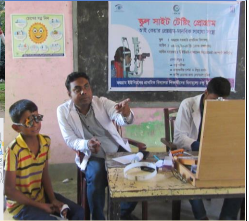
SSTP at Dahagram in Picture