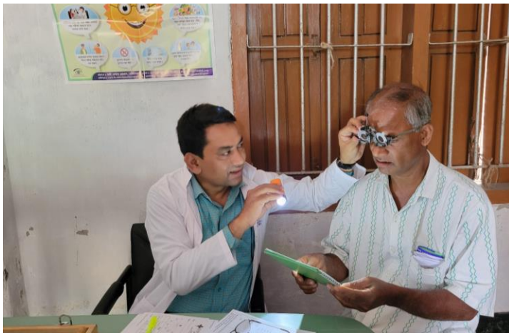
Patients eye examination going on at Nilphamari

In May 2024, ECP conducted seven (7) eye camps in Lalmonirhat, Panchagarh, and Nilphamari in conjunction with partner hospitals on 11 th May 2024. A total of 1676 patients were screened in these eye camps, and 513 spectacles were given out. Cataract was identified among 399 patients, and 282 surgeries were successfully performed. Technical support to the eye camps were provided by ECP’s partner hospital - Shafiuddin Ahmed Foundation (SAF) Hospital and Rangpur Eye Hospital.