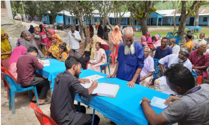
Patients waiting for the registration at Lalmonirhat