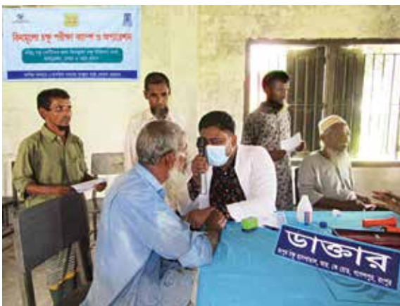
Doctor is screening a patient in an eye camp

One efficient approach to delivering eye care services quickly to a large population is by organizing public eye camps. These camps allow us to offer eye care treatment to numerous underserved individuals who come for eye care services. Additionally, we can distribute eyeglasses and medications to these patients. The eye camps also serve to identify individuals with cataracts who are immediately transported to our partner hospitals for surgery. Importantly, all these services are provided at no cost to the patients. The eye camps are conducted in collaboration with the local union parishad or educational institutions. The partner hospitals of ECP-MSS offer the necessary technical support for organizing the eye camps and performing surgeries while ECP staff and volunteers provide support services to the camps.