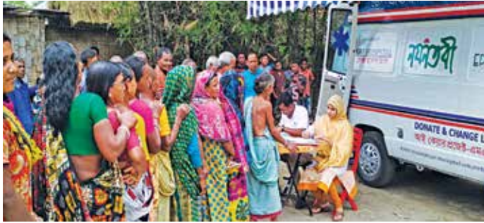
Noyon Tori eye camp on-going at Panchagarh