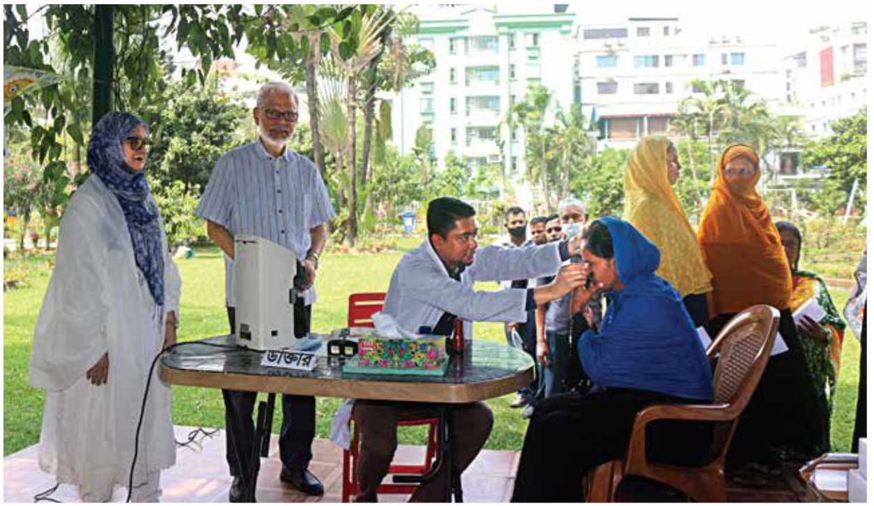
Doctor examining the eyes of a patient at Baridhara MLSS eye camp

Manabik Shahajya Sangstha's Eye Care Program continues to provide eye care services through a variety of eye camps catering to the underserved and underprivileged people of remote, rural areas and urban areas. ECP is providing access to quality and affordable eye care services.