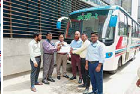
Noyon Tori-2 minibuss procured for smooth operation of ECP activities