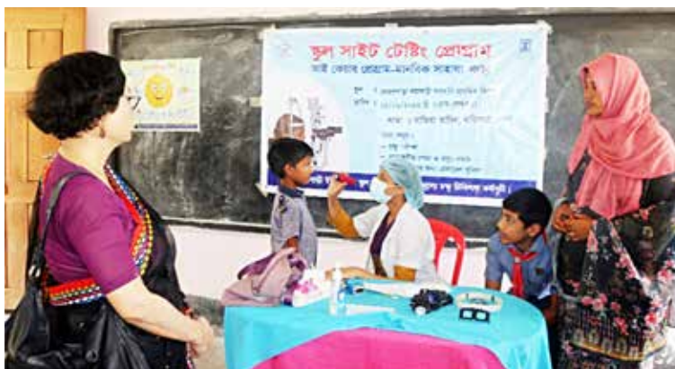
Our esteemed donor visited SSTP camp

ECP undertook to cover all schools of Khagakharibari Union, Dimla, Nilphamari, under its SSTP.