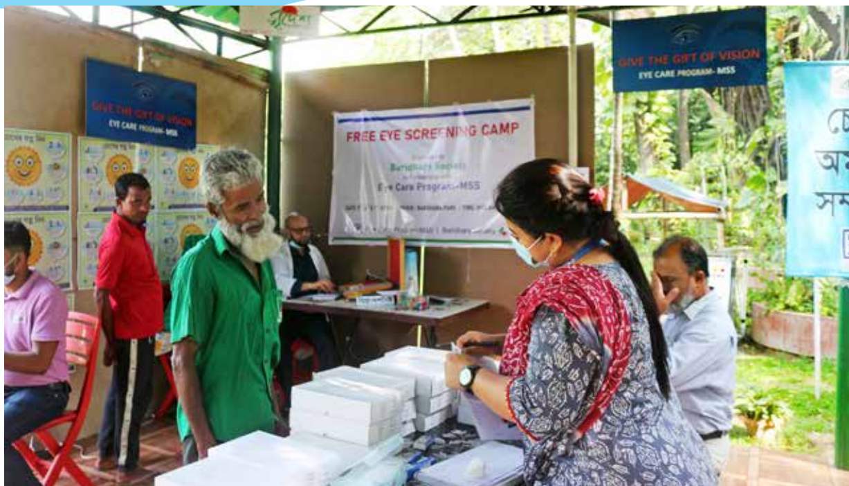
Distribution of free eyeglasses among patients