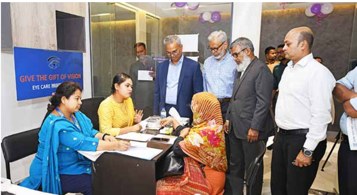
BGMEA President observing eye care service at BGMEA while distributing spectacles and medicine to the patients

Bangladesh Garment Manufacturers and Exporters Association (BGMEA) identified and recognized the need for providing eye care services to its workers and staff. The management identified ECP–MSS based on its successful track record, to dispense quality eye care services at discounted and affordable rates for the workers and staff of the garment factories. BGMEA took the initiative as part of their Corporate Social Responsibility. BGMEA realized the necessity of healthcare programs targeting their employees. ECP agreed to conduct an Eye Care Campaign as part of its ongoing program to make quality eye care available to the employees of BGMEA at affordable rates in their factory premises. ECP's eye camp was conducted at BGMEA Complex in Uttara, Dhaka on 28-29 May 2023.