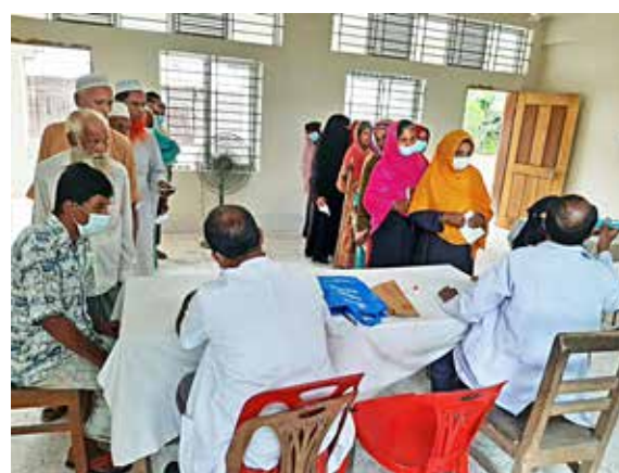
Patients are waiting for free eye screening