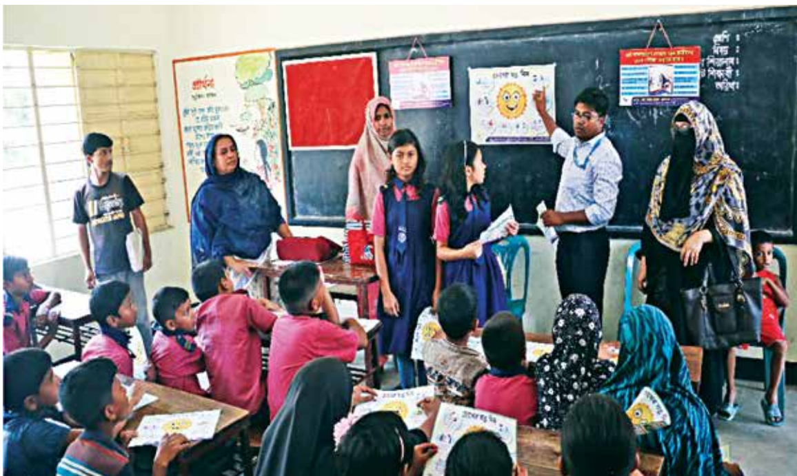
Awareness activity conducted by using flyers, posters, and placards

Basic eye care awareness empowers individuals to take control of their eye health. By understanding the importance of routine eye exams, maintaining a healthy lifestyle, and protecting their eyes from potential hazards, individuals can actively engage in preventive measures and make informed decisions about their eye care. For awareness raising among people, 32,000 flyers, 110 posters, with 67 interactive presentations made by the ECP community educator for the school children.