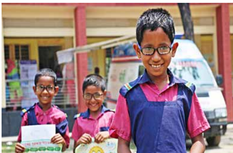
Students get custom-made eyeglasses