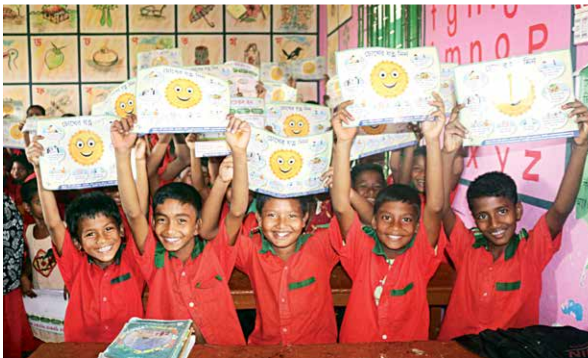
Cheerfull school students at an eye care awareness presentation

To help marginalized people, ECP offers a range of eye care services to those in need in both urban and rural locations, ECP offers free Public Eye Camps. Underserved school children are given exclusive services through its School Sight Testing Program (SSTP). ECP reaches out to industrial workers through its Industrial Sight Testing Program (ISTP). In addition to offering comprehensive eye care at these eye camps by providing medicines and eyeglasses, when necessary, the Healthy Eyes for Road Safety (HERS) program addresses the eye care needs of public transportation workers. Primarily, cataract patients are identified and get surgery immediately to regain their lost vision. Eye care awareness activities are carried out by handing out leaflets and posters, showing videos, and making interactive presentations at the eye camps.