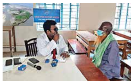
Patient consulting with Doctor at Jadur Char Eye Camp

Chars are landmasses formed through the sedimentation of huge amounts of sand, silt and clay over time carried by the mighty rivers and their numerous tributaries. Flooding, land erosion, poor communication, unemployment, food insecurity, and poor health care combine to make the lives of char residents much tougher than mainland people in Bangladesh. Chars are home to 5 million people in Bangladesh.