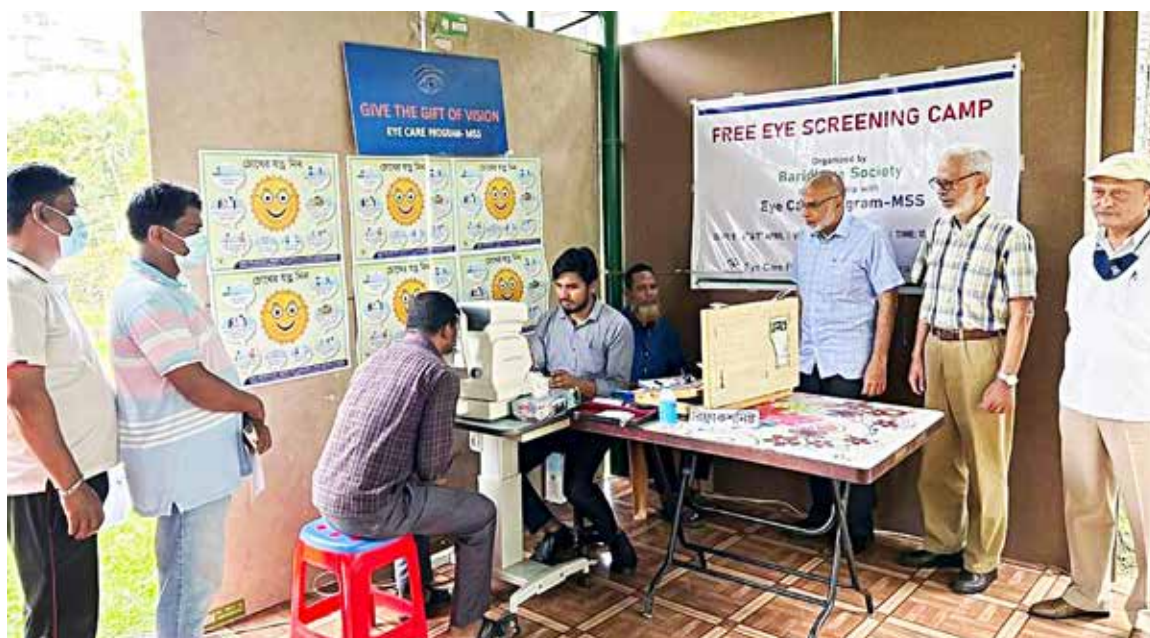
MSS President visited an eye camp organized for Baridhara MLSS workers

All ECP-MSS activities are carried out from individual and corporate donations complemented by a generous grant from MSS. During the reporting period, an amount of Tk. 89.96 lacs was raised from our esteemed donors – both individual and corporate.