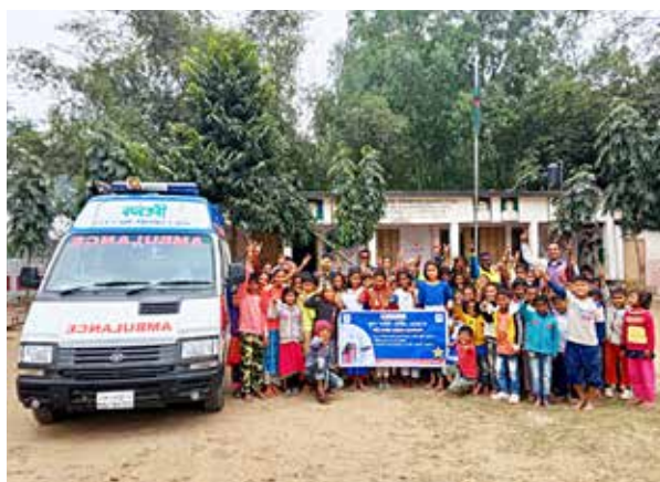
Students are holding the ECP Banner beside Noyon Tori mobile eye clinic