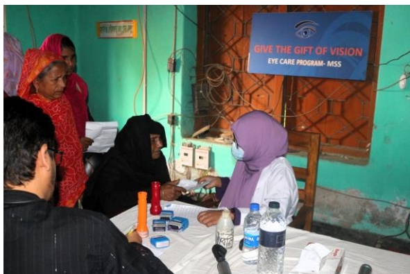
Doctor examining eyes of patients at a Sadullahpur village in Gaibandha