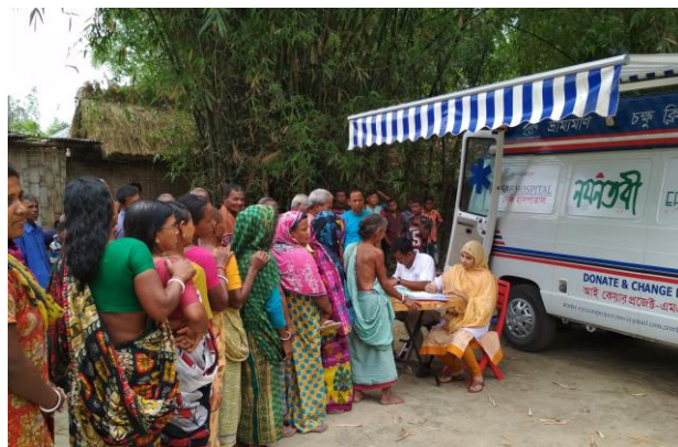
Patients waiting for eye examination at a remote village in Panchagarh