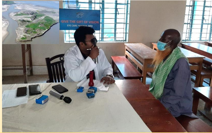
Underserved patient of far-flung, inaccessible Jadur Char consulting our Eye doctor

Chars are landmasses formed through the sedimentation of huge amounts of sand, silt and clay over time carried by the mighty rivers and their numerous tributaries. Flooding, land erosion, poor communication, unemployment, food insecurity, and poor health care combine to make the lives of char residents much tougher than mainland people in Bangladesh. Chars are home to 5 million people in