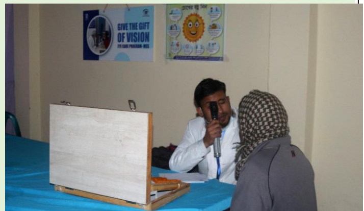
Patient eye examination going on at Nilphamari