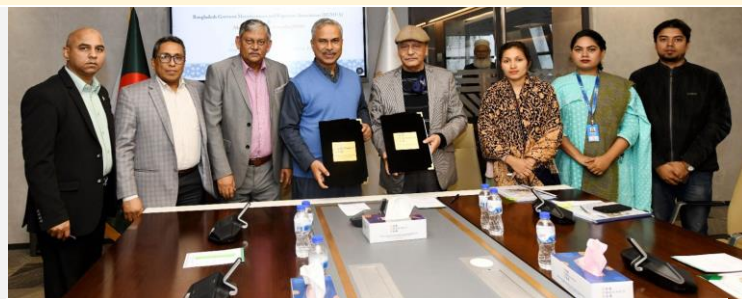
BGMEA, MSS sign MoU to ensure eye health services to RMG workers

On 15 th January 2024, ECP conducted one eye camp in Kamarpukur Union Parishad Saidpur, Nilphamari district in conjunction with Rangpur Eye Hospital. In this camp, 483 patients were screened, and 201 spectacles were given out. Cataracts were identified among 114 patients, and 53 surgeries were successfully performed. Between the 21 st to 28 th of January, 169 surgeries were successfully performed at Chapainawabganj Eye Hospital. These patients were identified Shah Neamatullah Shishu Sodon, Satrajitpur, Shibganj.