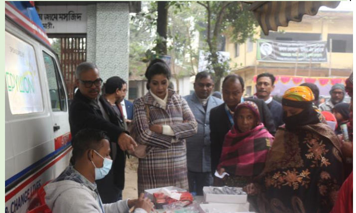
BGMEA President visited ongoing eye camp at Kamarpukur