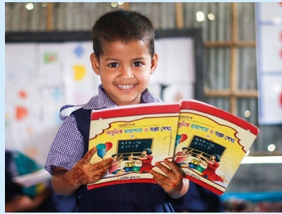
SHISHUKANON- PRAK PRATHOMIK BIDDYALOV & NFPE