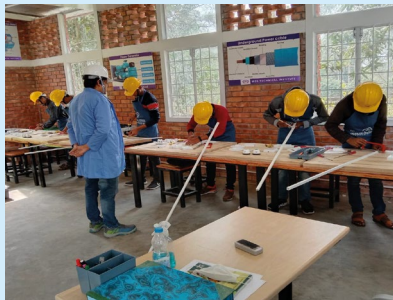
ELECTRICAL INSTALLATION & MAINTANACE COURSE

“The MSS programs have significantly empowered women and marginalized communities, provided a pathway to economic independence, and created a more equitable society.”