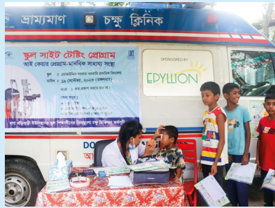
SCHOOL SIGHT TESTING PROGRAM