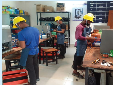
REFRIGERATION & AIR CONDITIONING LAB