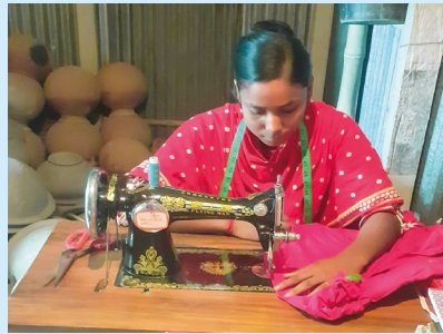
DRESS MAKING & TAILORING