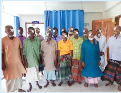
POST SURGERY PATIENTS