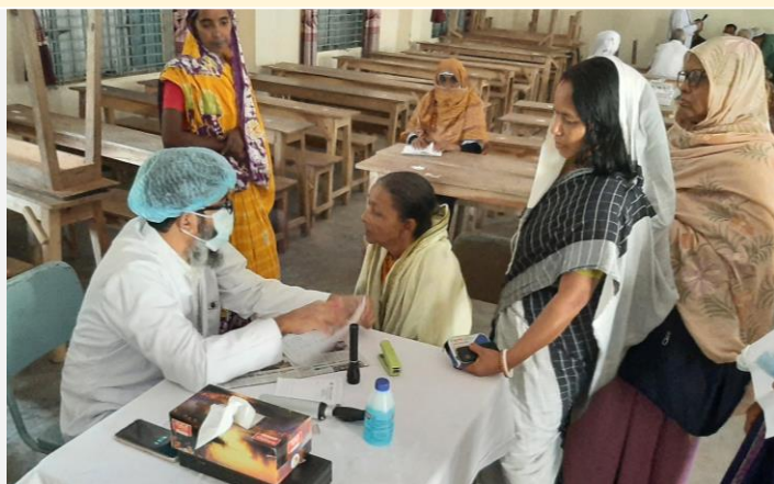
Patients eye examination going on at Thakurgaon

In October 2023, ECP conducted thirteen (13) eye camps in Thakurgaon, Dinajpur, Panchagarh, Chapainababganj, Rangpur, Dinajpur, and Pabna districts in conjunction with partner hospitals between 7 and 28 October 2023. These 13 eye camps provided comprehensive eye care services to 5,358 underserved people through qualified doctors, technicians, and modern eye screening equipment. In these eye camps, free spectacles were given out to 1044 patients. Additionally, 2326 flyers and posters were distributed to the patients to raise awareness of basic eye care. Technical support to the eye camps was provided by ECP's partner hospitals - Shafiuddin Ahmed Foundation (SAF) Hospital, Thakurgaon, Makka Eye Hospital, Rajshahi, and Rangpur Eye Hospital, Rangpur.