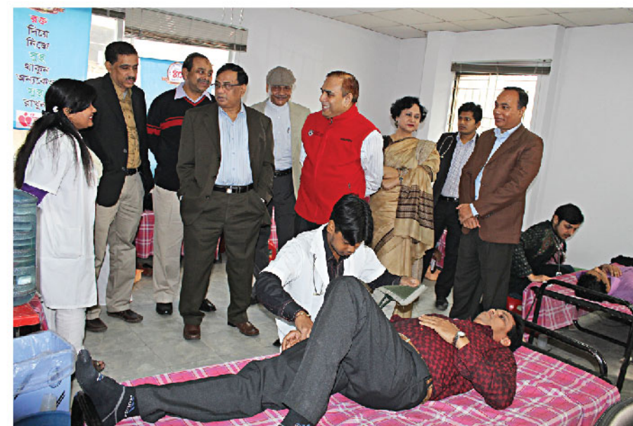
The guests observe Voluntary Blood Donation (VBD) program jointly organized by MSS and Quantum Foundation.