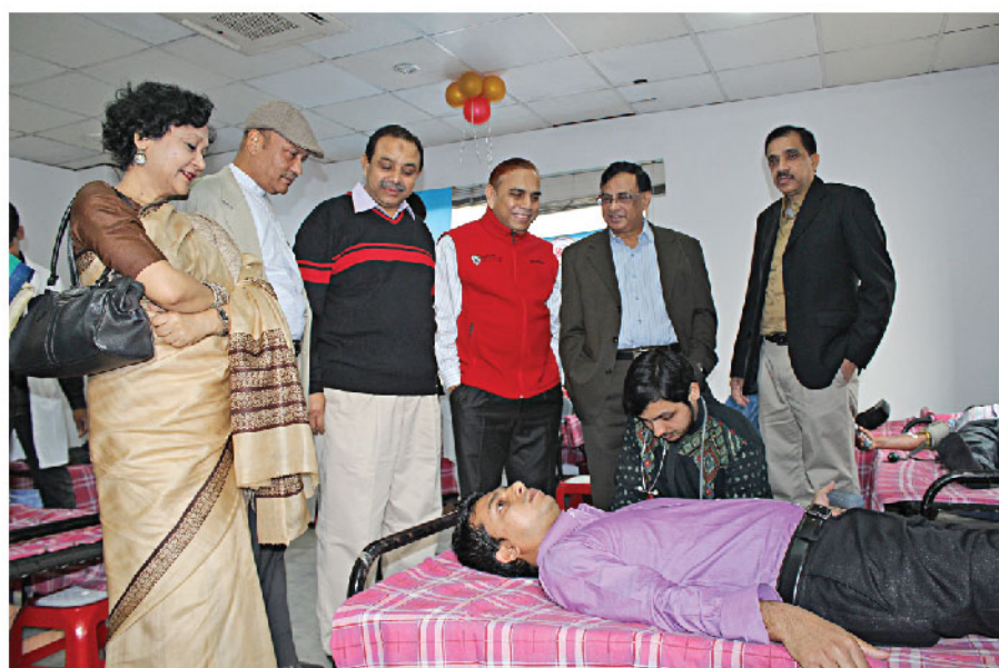
Voluntary Blood Donation (VBD) program is being visited by the invited guests.

On January 9, 2015 a day long VBD program was jointly organized by MSS