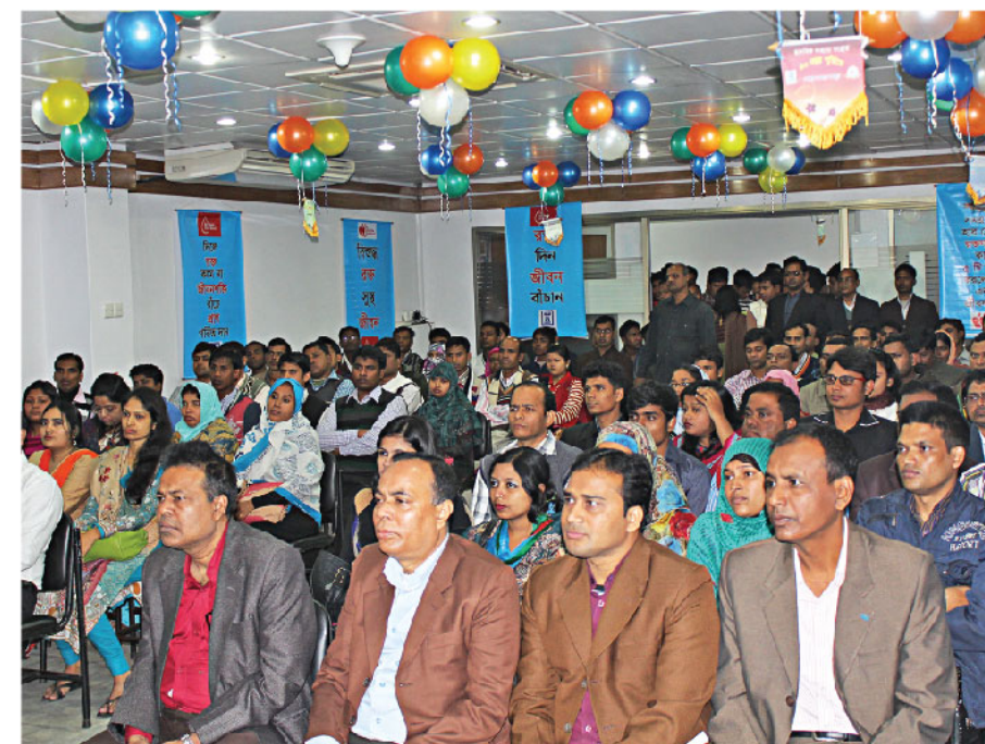
MSS's staffs at the inaugural event of Voluntary Blood Donation Program.

As a part of its 40th anniversary celebratory programs, for the first time, MSS implemented a "Voluntary Blood Donation (VBD)" program. Voluntary blood donation is a social responsibility. All donations to charity make a difference, whether they consist of money, clothing, or simply a couple of hours spent volunteering. While every contribution is equally important, nothing is comparable to the donation of human blood. In spite of the remarkable achievements of medical science today, there is no factory that manufactures blood. It is only in human beings that human blood is made and circulated. For those who require blood for saving their lives, sharing from other fellows is the only means. Hence, donation, rather voluntary donation, is the only way of accumulating blood at safe storage to meet emergency require-