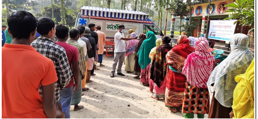
ECP member measure patient's temperature while they waiting for eye screening at Doorsteps Eye Camp, Thakurgaon.