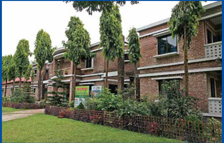
A view of Shafiuddin Ahmed Foundation Hospital at 11 mile, Mujabarni, Thakurgaon.