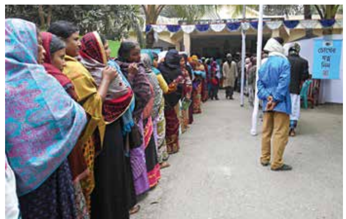
People of Balia union are on the queue to undergo eye examination before cataract surgery