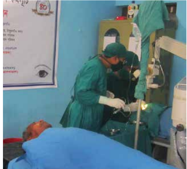
New lenses are being placed by the specialist surgeons at Shafiuddin Ahmed Foudation Hospital (SAf) in Thakurgaon