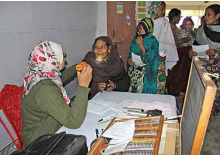
Eye patients being examined by specialist surgeons at Bangalipur union