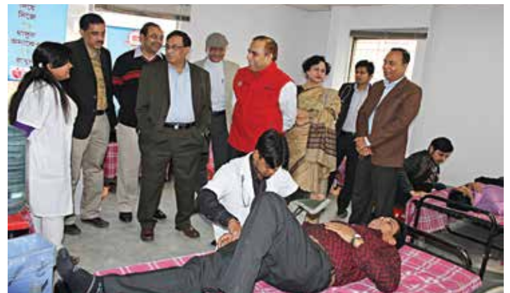
Voluntary Blood Donation (VBD) program organized by MSS

Seventy two (72) staffs volunteered of which 70 qualified (of which 66 were male donors and 4 were female donors) to donate blood based on initial screening. Seventy (70) bags of blood each containing 350 ml for a total of 24,500 ml blood were collected and