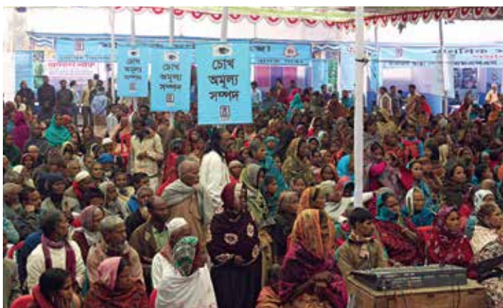
People of Bangalipurpur union gathered to get free eye treatment